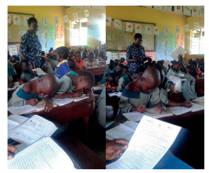
Universal Primary Education (UPE) Class in progress

In the area of protection, Uganda has been able to carry out massive immunisation against measles and polio, distribution of insect treated nets, provision of safe water,