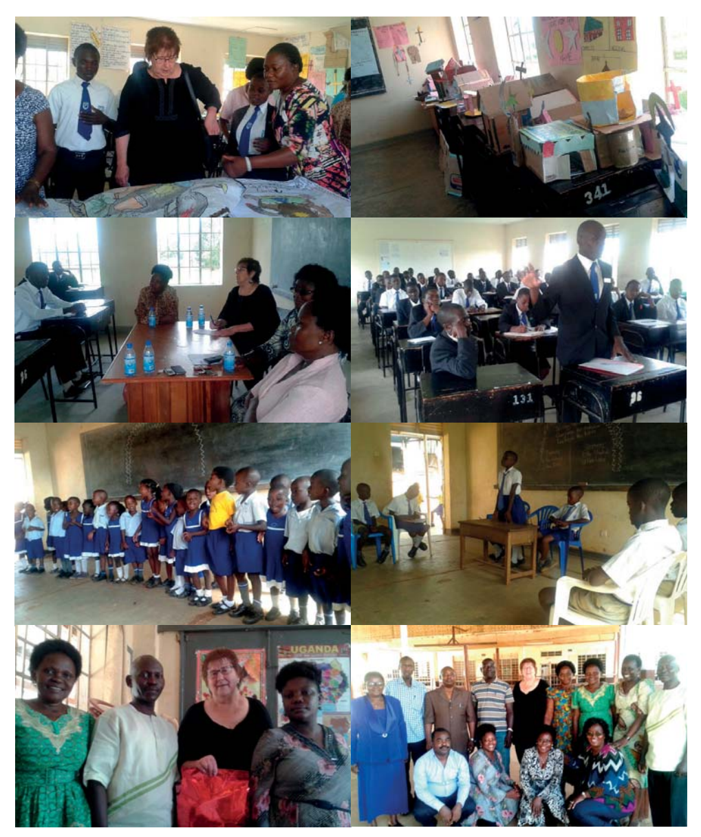
Highlights of the Mentors Visit in Pictures

The Mentor also visited Kira Primary School. Here two teacher trainees from Shimoni CPTC held a physical education lesson in which they demonstrated child participation through allowing the children to design their own play materials and choosing which games to play after making the materials.